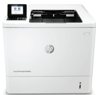
HP LaserJet Managed E60065dn

This HP LaserJet Printer with JetIntelligence combines exceptional performance and energy efficiency with professional-quality documents right when you need them—all while protecting your network from attacks with the industry's deepest security. 1