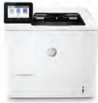
HP LaserJet Managed E60155dn

Dynamic security enabled printer. Only intended to be used with cartridges using an HP original chip. Cartridges using a non-HP chip may not work, and those that work today may not work in the future. http://www.hp.com/go/learnaboutsupplies