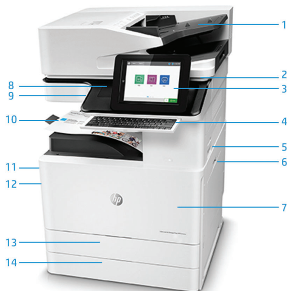
HP Color LaserJet Managed Flow MFP E87640z