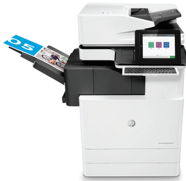
HP Color LaserJet Managed Flow MFP E87640z

*Purchase of optional paper trays and output accessory availability varied by device