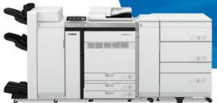
imagePRESS V900 shown with optional accessories.