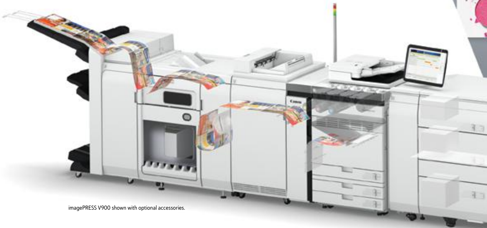
imagePRESS V900 shown with optional accessories.